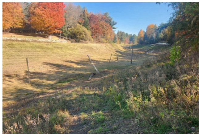
Thomas Shores canal after mowing